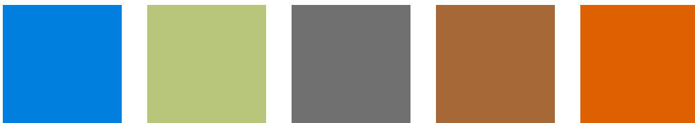
A B C D

FIND THE ILLEGITIMATE CHILD. WHO IS THE MOTHER?