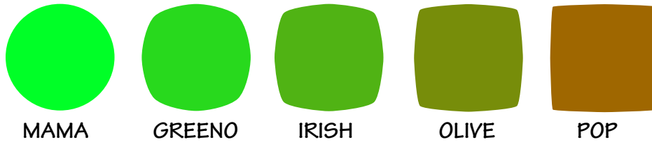
MAMA GREENO IRISH OLIVE POP

Circus FREAKS are unacceptable discrimination today, but we still tolerate FREAKS in art?